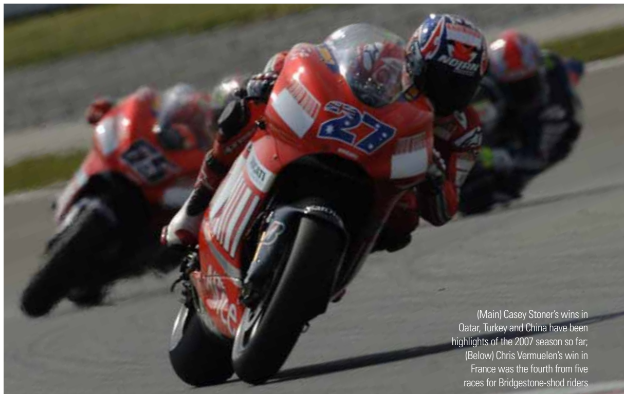
(Main) Casey Stoner's wins in Qatar, Turkey and China have been highlights of the 2007 season so far; (Below) Chris Vermeulen's win in France was the fourth from five races for Bridgestone-shod riders

The moment Bridgestone-shod vehicles started to win races and championships with tyres that I personally designed really has to be my proudest moment. However, I also feel proud when our tyres perform better than those of our competitors – even if we don't win the race or the championship. Ultimately, I am always really happy when standing beside racing cars at the race track.