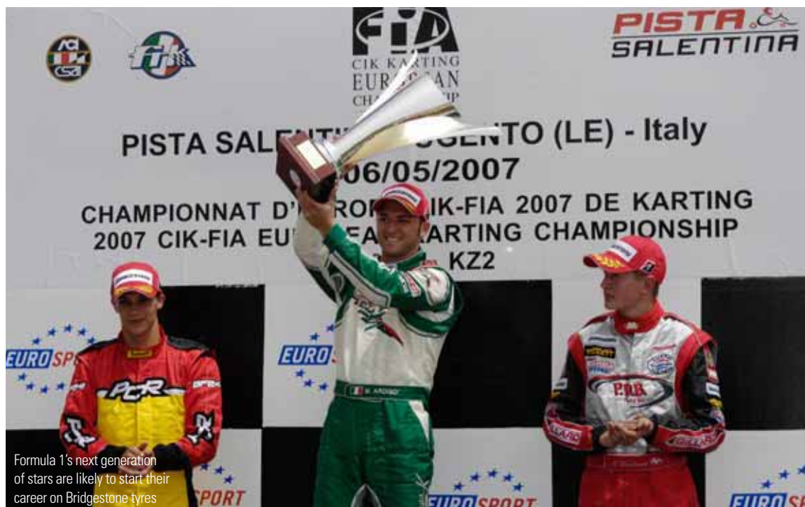
Formula 1's next generation of stars are likely to start their career on Bridgestone tyres

Ultimately, though, the right-rear Bridgestone held firm and so did the Finn's resolve. Häkkinen steered through the streets to clinch both his and Bridgestone's first win in Monaco. In the next nine years, Bridgestone would score four more.