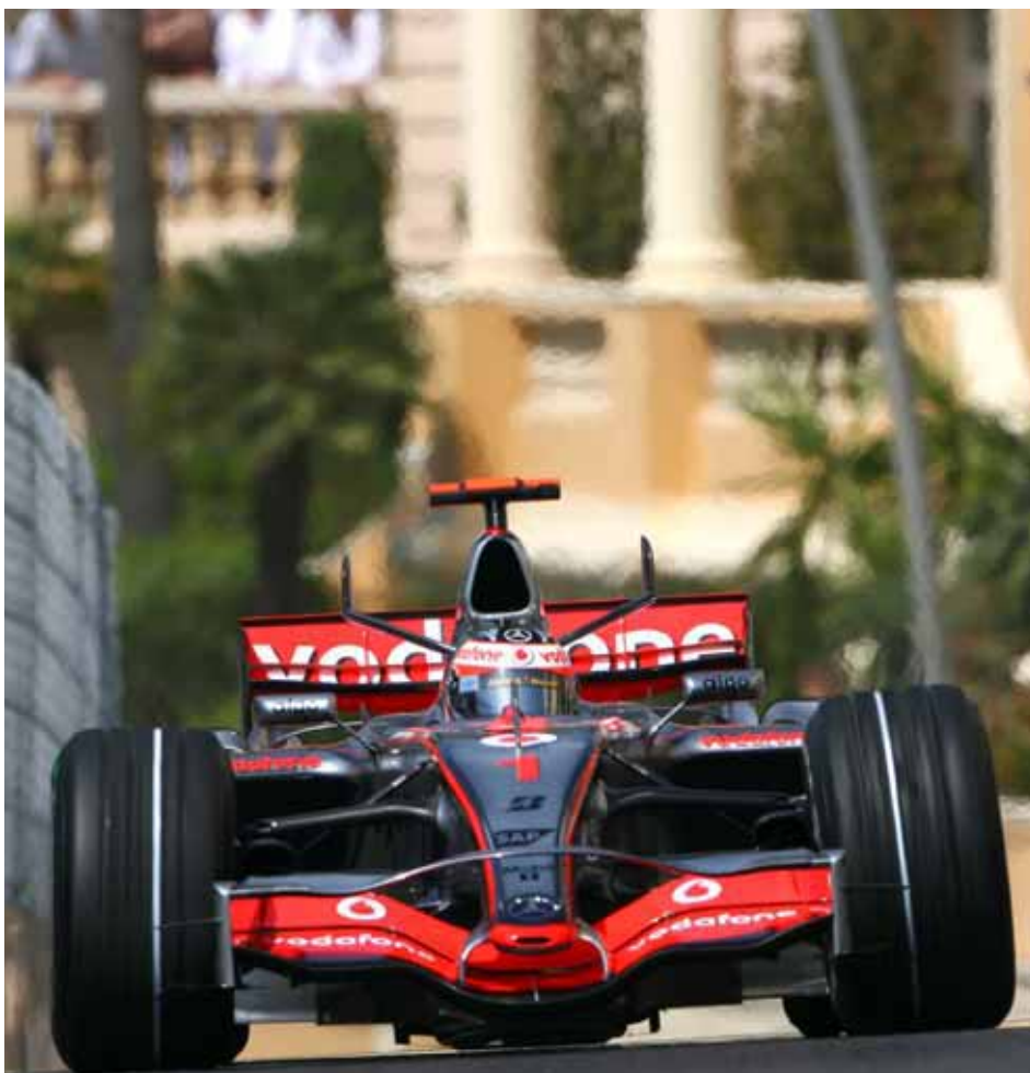
Fernando Alonso's Monaco win puts him back in the joint lead of the title chase with McLaren team-mate Lewis Hamilton